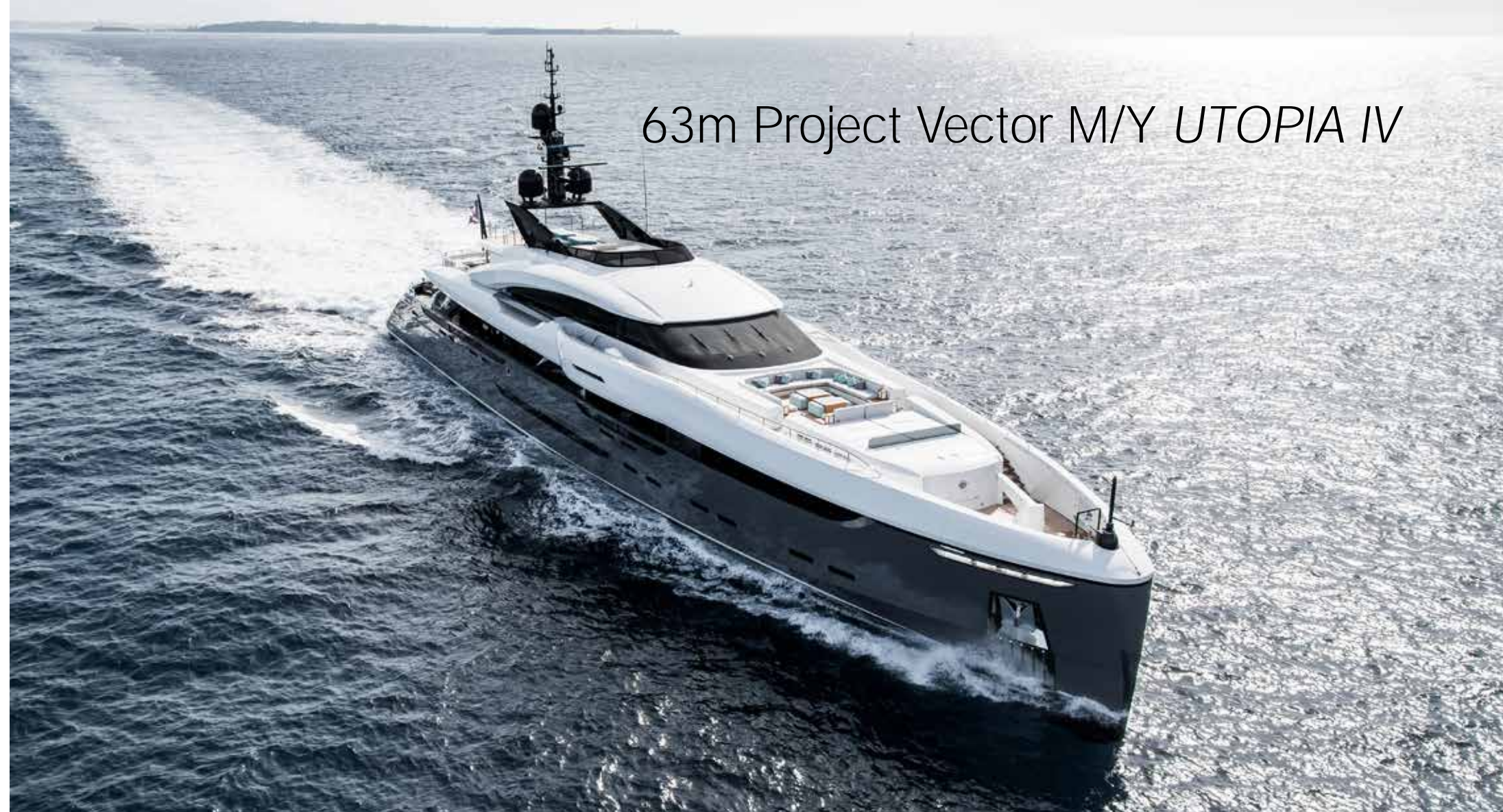
63m Project Vector M/Y UTOPIA IV

Great care has been given to the lighting design, which has been specifically studied to create settings that can enhance different indoor atmospheres and emphasize the space available, especially using indirect lighting scenes. Some main walls and portions of ceilings have been backlit to create scenic effects in focal points of the interiors.