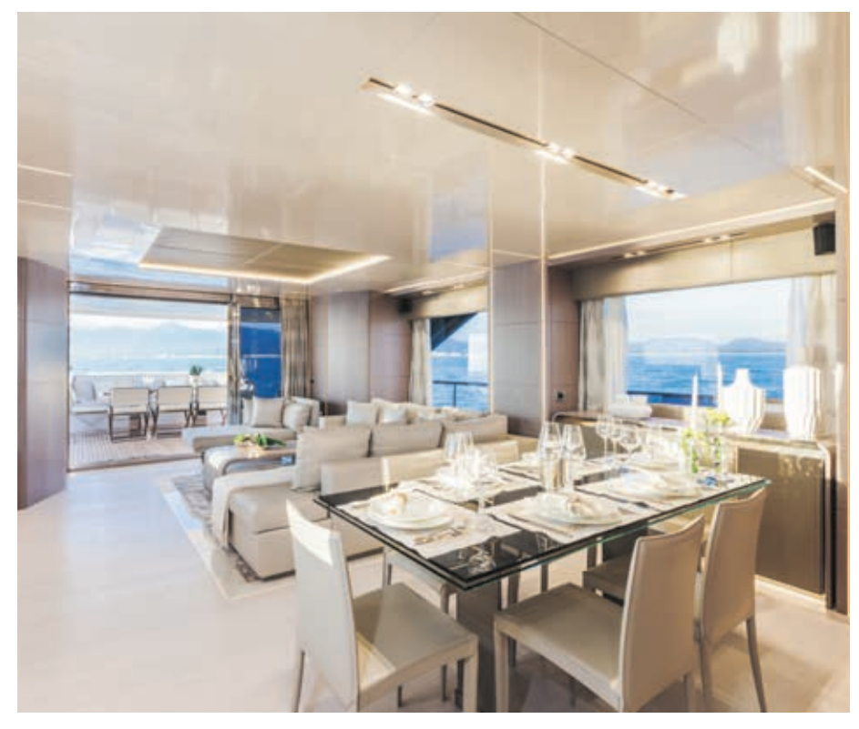
Extensive glazing and dropped gunwales provide immense seaviews from the interior

Fully spec'd with all the bells and whistles, the debutant sidled up to the dock using her bow and stern thrusters, providing us a view from the stern of her underwater light array and a tender garage that houses a 10' (3m). The transom offers more features than a Swiss Army knife, with a letterbox passerelle and lowering platform to starboard and a multi-level articulating transformer that was custom designed for Dreamline by Besenzoni to port. Adding to this lateral boarding amidships when