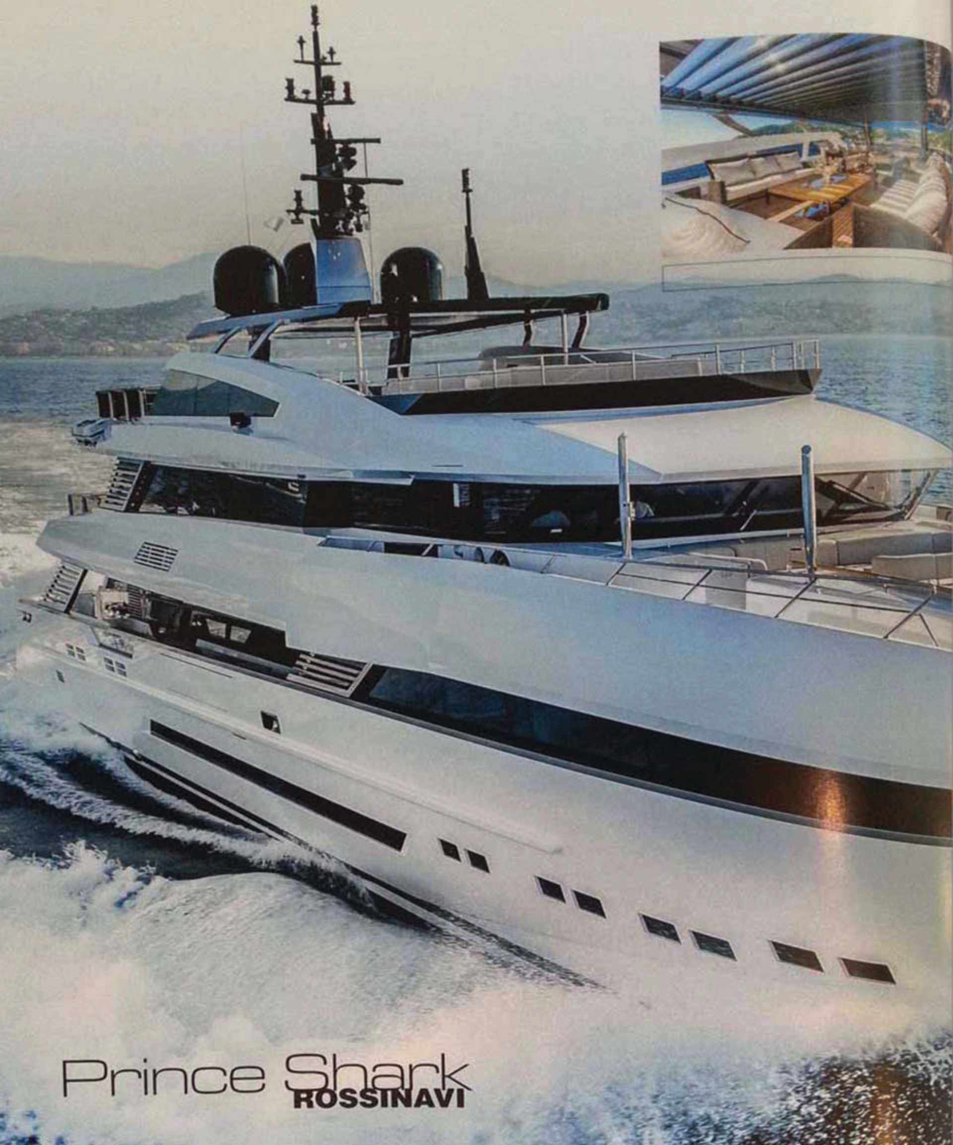
Prince Shark ROSSINAVI